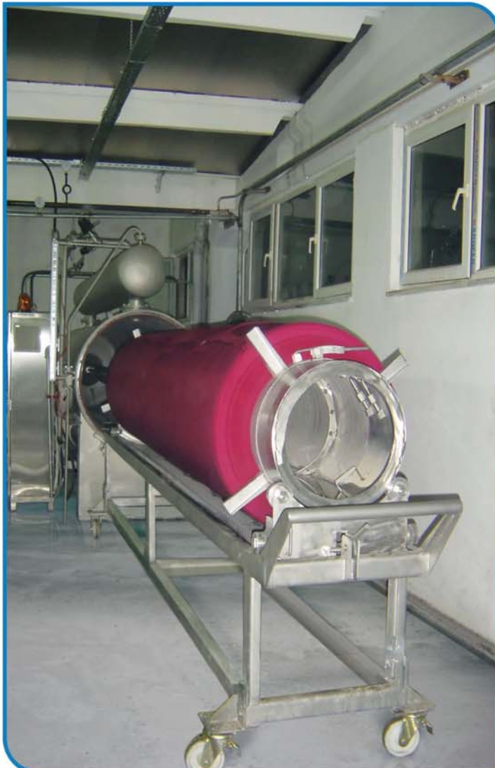
Fabric batc on a dye beam, beam carrier and transport trolley the dyeing machine.